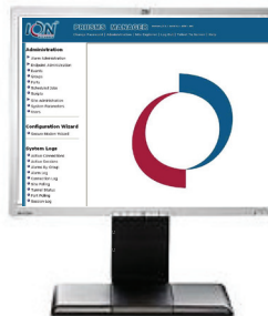
PRIISMS SECURE ACCESS GATEWAY

Up to 50 Connected Devices Multiple Vendors IP & Dial-Up Access