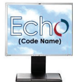
ECHO VENDOR MANAGEMENT PLATFORM

200 Concurrent Sessions Hundreds of Vendors IP & Internet Access Centralized Management Audit & Session Logs